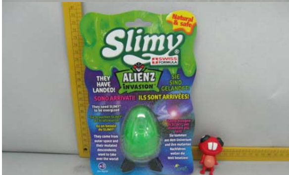
Sample Number (5210)008-0187