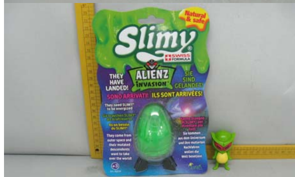
Sample Number (5210)008-0187