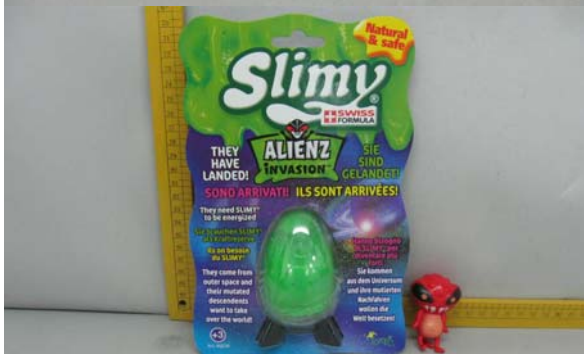
Sample Number (5210)008-0187