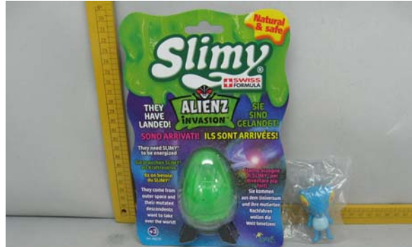
Sample Number (5210)008-0187