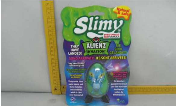
Sample Number (5210)008-0187